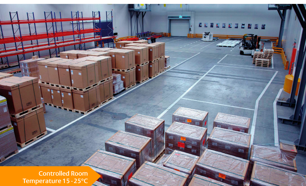
Controlled Room Temperature 15 - 25°C

the cargo handling activity allowing very short transit times from the aircraft via the warehouse to the truck (and vice versa) is predestined for time sensitive, valuable and temperature controlled shipments. The new Pharma & Healthcare Center prepares LuxairCARGO for the future growth of this special type of air cargo.